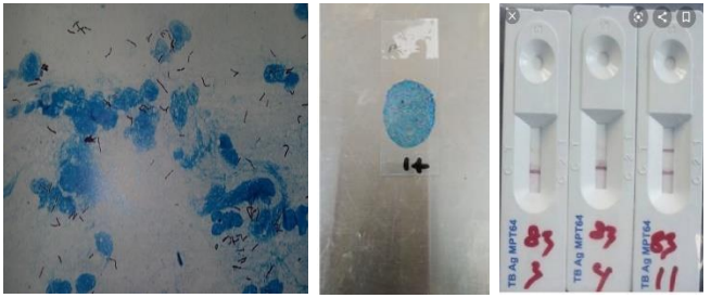
Figure 4. The results of AFB (+) and MPT 64 (+)

Rapid test of ICT Mycobacterium protein-64 tuberculosis (MPT 64) is an immunological test with high sensitivity and specificity, making it an alternative for identifying M.Tb and MDR-Tb (Haryanto, 2015). MPT64 protein can be identified and influenced by the minimum number of germs of 10-5 cfu/ml. MPT 64 serves as a specific antigen secreted by the M.Tb complex (M. tuberculosis, M. africanum, M. bovis) during MTb growth. This protein has a molecular weight of 24 kDa and is only found in MTb, so it can be used for identification using immunochromatographic (ICT) principles via antigen-antibody binding. Isolates from pulmonary and extrapulmonary samples cultured on liquid or solid media can be used in the MTb identification test with the ICT MPT 64 method (Kanade et al, 2012).