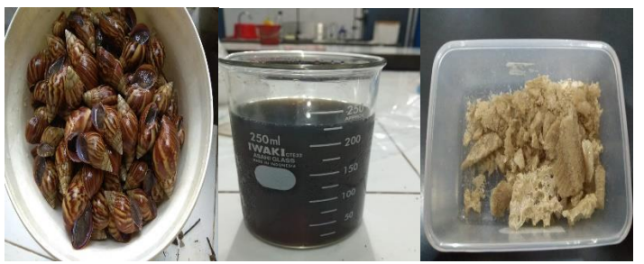
Figure 2. Freeze-drying of snail seromucoid

Chitosan as a compound \beta -(1.4)-2 amino-2deoxy D-glucopyranose can be obtained through the deacetylation of chitin with the addition of 60% NaOH alkaline solution and heating at a temperature of 60°C-100°C. The effectiveness of chitosan as an antimicrobial is related to the role of Chito-Oligosaccharide compounds (COS) as a glycan-binding protein complex compound, which contains 1,4-b-glucosamine (Kazami, 2005). The antimicrobial activity of COS is highly dependent on the degree of deacetylation, polymerization, and the type of bacteria and fungi. As an alternative antibiotic, COS is more effective because it does not produce a residue. Chitosan is unique in that it is polycationic and can inhibit the growth rate of diarrhoeagenic Escherichia coli in vitro (Harti et al, 2016). Chitosan is biocompatible, biodegradable, non-toxic, and antimicrobial, making it useful as a wound-healing agent. Because it is biodegradable, non-toxic, non-immunogenic, and biologically biocompatible with animal tissues, it has been widely used in the biomedical and pharmaceutical fields (Fernandes et al., 2010).