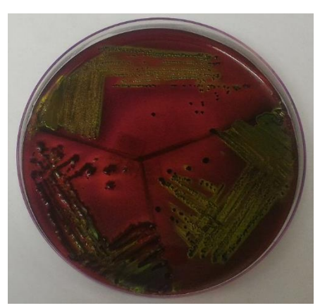
Figure 1. Escherichia coli on EMBA agar

The bacteria is classified as an environmental contaminant caused by lack of proper sanitation. On the farm, the bacteria often contaminate animal product including chicken meat.[1]