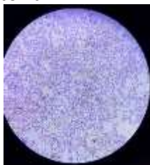
Image 2. Gram stain results

Gram stain. The observations of bacteria in the form of rod cells, small, scattered, and purple in color, show that the bacteria identified by Gram staining were indeed Propionibacterium acnes bacteria.