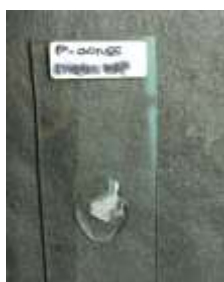
Image 3. Catalase test results

Catalase test. The test results showed the presence of gas bubbles (O 2 ) on the surface of the glass object. This is because the P. acnes bacteria produce catalase enzymes which can decompose hydrogen peroxide (H 2 O 2 ) into water (H 2 O) and gas bubbles (O 2 ).