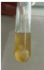
Image 4. Coagulase test results

Coagulase test. The coagulase test results for P. acnes bacteria gave positive results, which were indicated by the formation of clots in the plasma, and when turned over, the plasma did not spill and remained attached to the test tube wall. Plasma clots are formed because the P. acnes bacteria can produce coagulase, which converts fibrinogen into plasma. Coagulase is a protein from P. acnes that can coagulate plasma when added with citrate or oxalate.